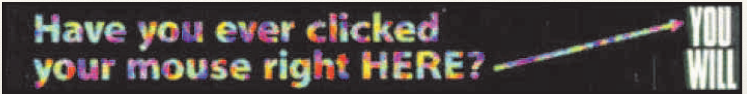
October 1994: Very first Internet Ad

By 2014, Internet advertising surpassed television as the #1 advertising venue in the United States.