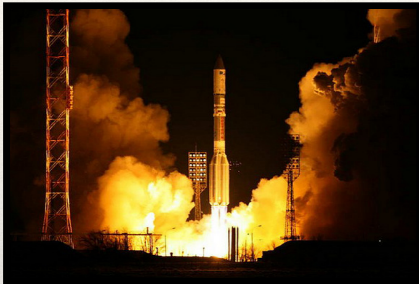
Launch of DirectTV 12