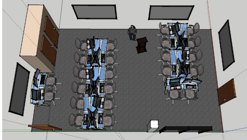
Figure 1. Pre-Renovation Computer Layout Design. This shows the overall concept of the lab given the space available.

The functionality that enabled video from any work station to be displayed was further enabled by the set-up of the individual work stations. There are a total of twelve computer work stations, which at full capacity are designed to each host two students. This set-up allows for a total of 24 students to participate at lab workstations. These twelve stations are set-up with a highly capable system running Linux. This environment was found to be optimal from a network management perspective. Alternative options for this set-up proposed by industry partners would have resulted in twelve access points of limited independent computational capabilities, which would then access more powerful central server running simulated flight operations software. Although this solution may have been of marginally lower cost, the prerogative to enable research led to a decision that each station would be of sufficient